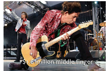
Keith Richards from the Rolling Stones has a $1.6 Million dollar policy on his middle finger!