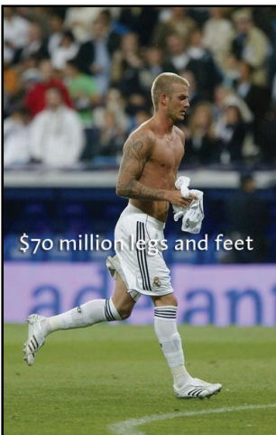
Apparently David Beckham's legs and feet are worth $70 Million?!

Unlike any normal human being, (celebs are anything but normal) celebrities and athletes buy insurance policies...but not just on homes and autos, but on their body parts!