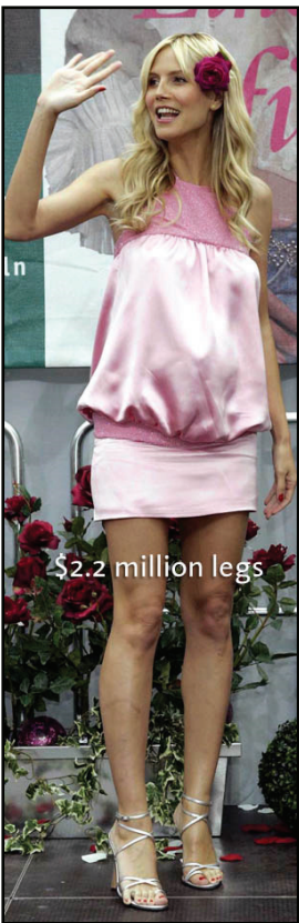
Heidi Klum Has Her Legs Insured for $2.2 Million!